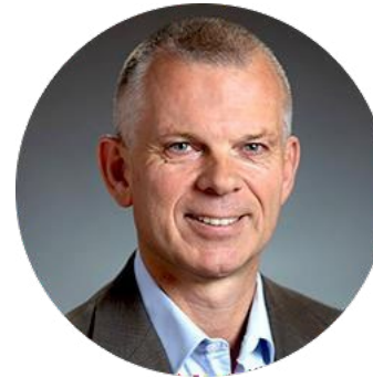
Julius De Kempnaer Netherlands

Creator of Bollinger Band, one of the famous indicators.