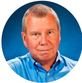
John Bollinger, CFA, CMT USA

Creator of Bollinger Band, one of the famous indicators.